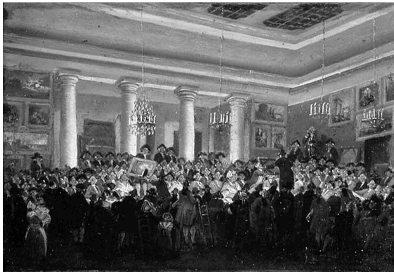
Pierre-Antoine de Machy, Public Sale at the Hôtel Bullion , Musée Carnavalet, Paris