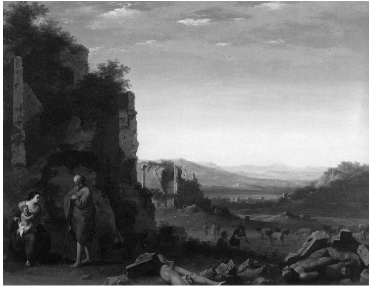
Cornelis van Poelenburgh, Rest on the Flight into Egypt , c. 1640, oil on copper, 34 x 44 cm, Fogg Art Museum, Cambridge